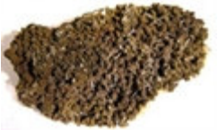
Kutnohorite & Calcite, Broken Hill, New South Wales, Australia